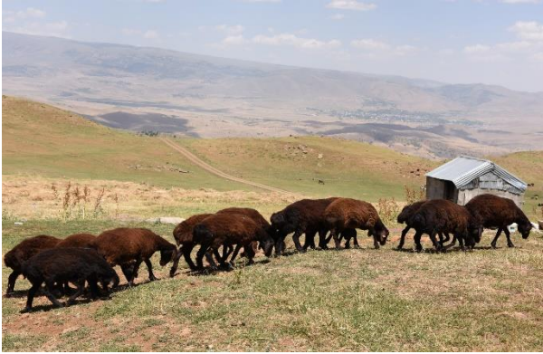
Figure 1. A herd of Morkaraman sheep.

Averages for the birth weight, the weaning weight, and daily live weight gain of Morkaraman sheep are presented in the Table 1.