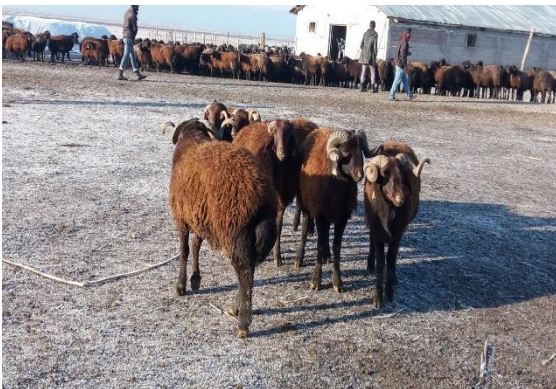
Figure 2. Morkaraman rams.